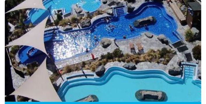
HOT POOLS PLUS COOLER POOLS & KIDS AQUA PLAY